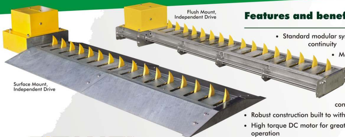
Surface Mount, Independent Drive